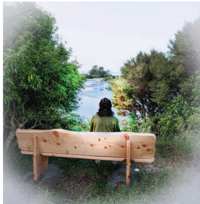
Natalie enjoying the view - November 2023