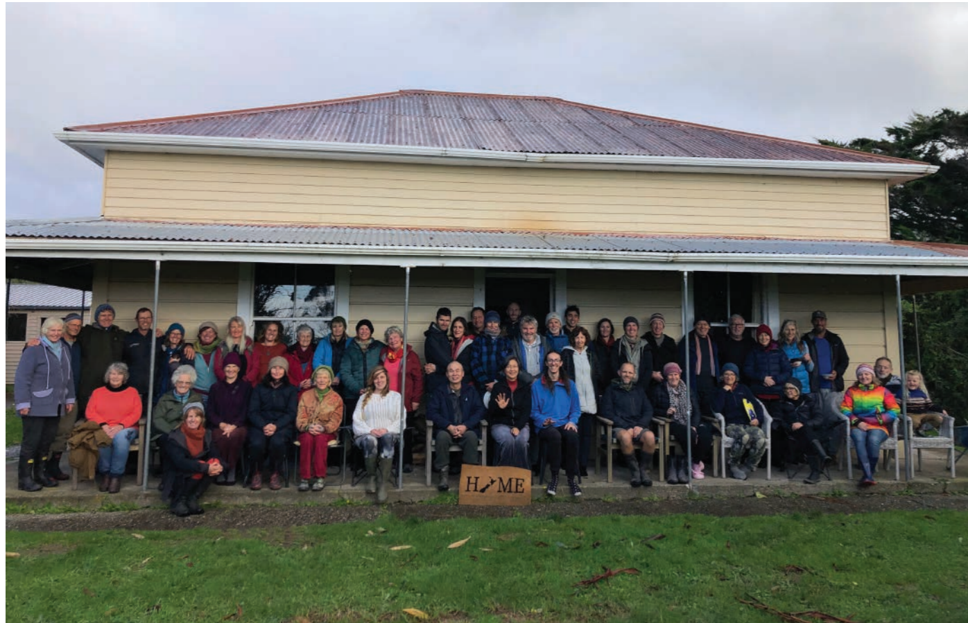
A home for Ren Xue - Old Villa, June 2022