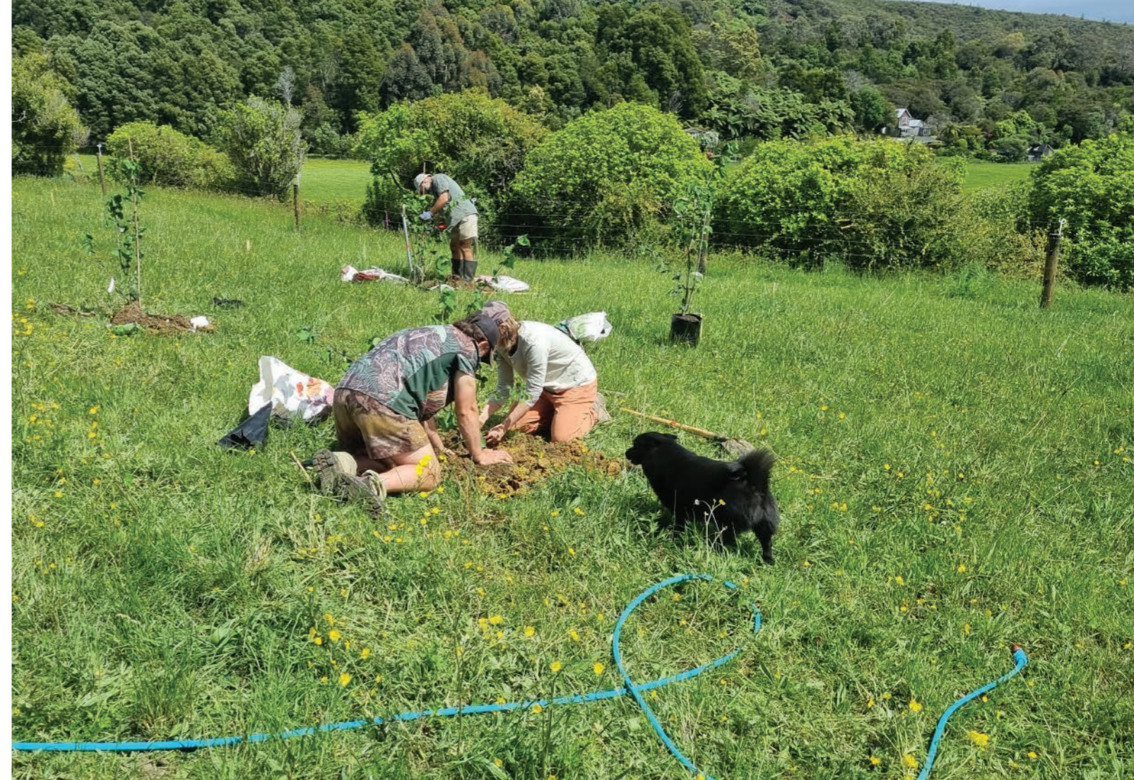
Planting avocado trees - November 2023

S: Yes this kind of approach involves making lots of decisions, which isn't too difficult so long as you know