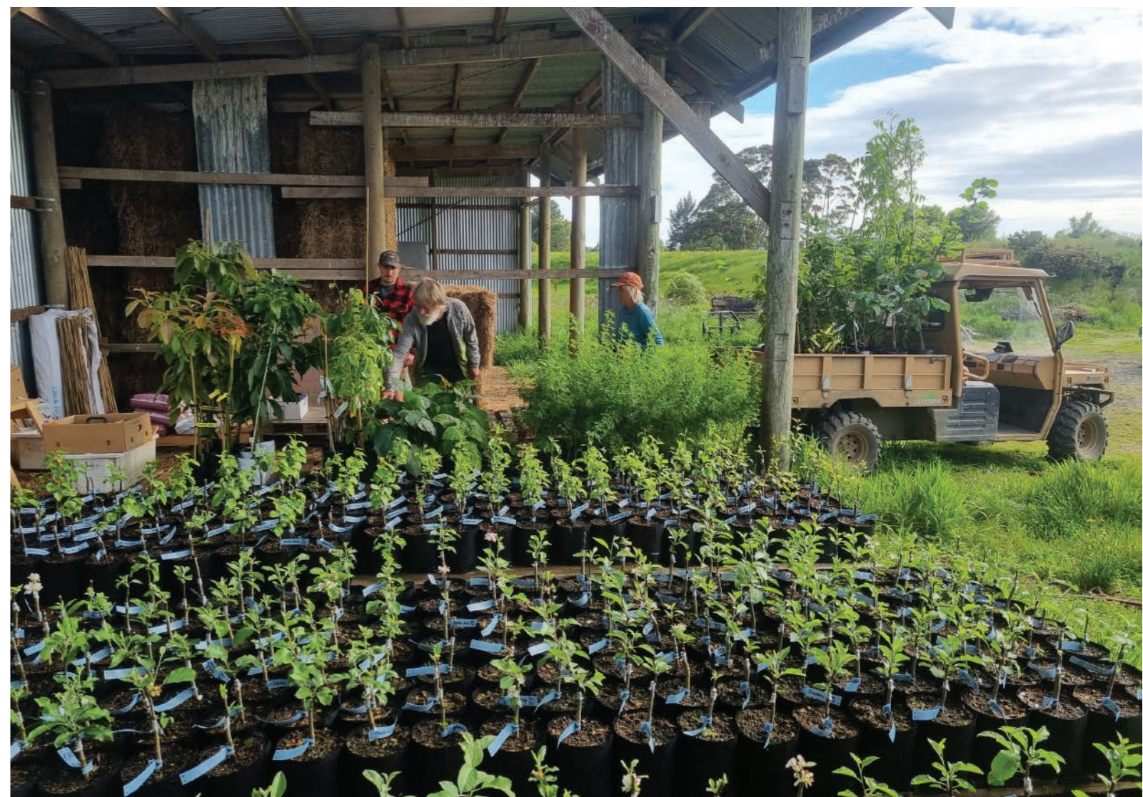
Trees, trees, trees - getting ready for a new home