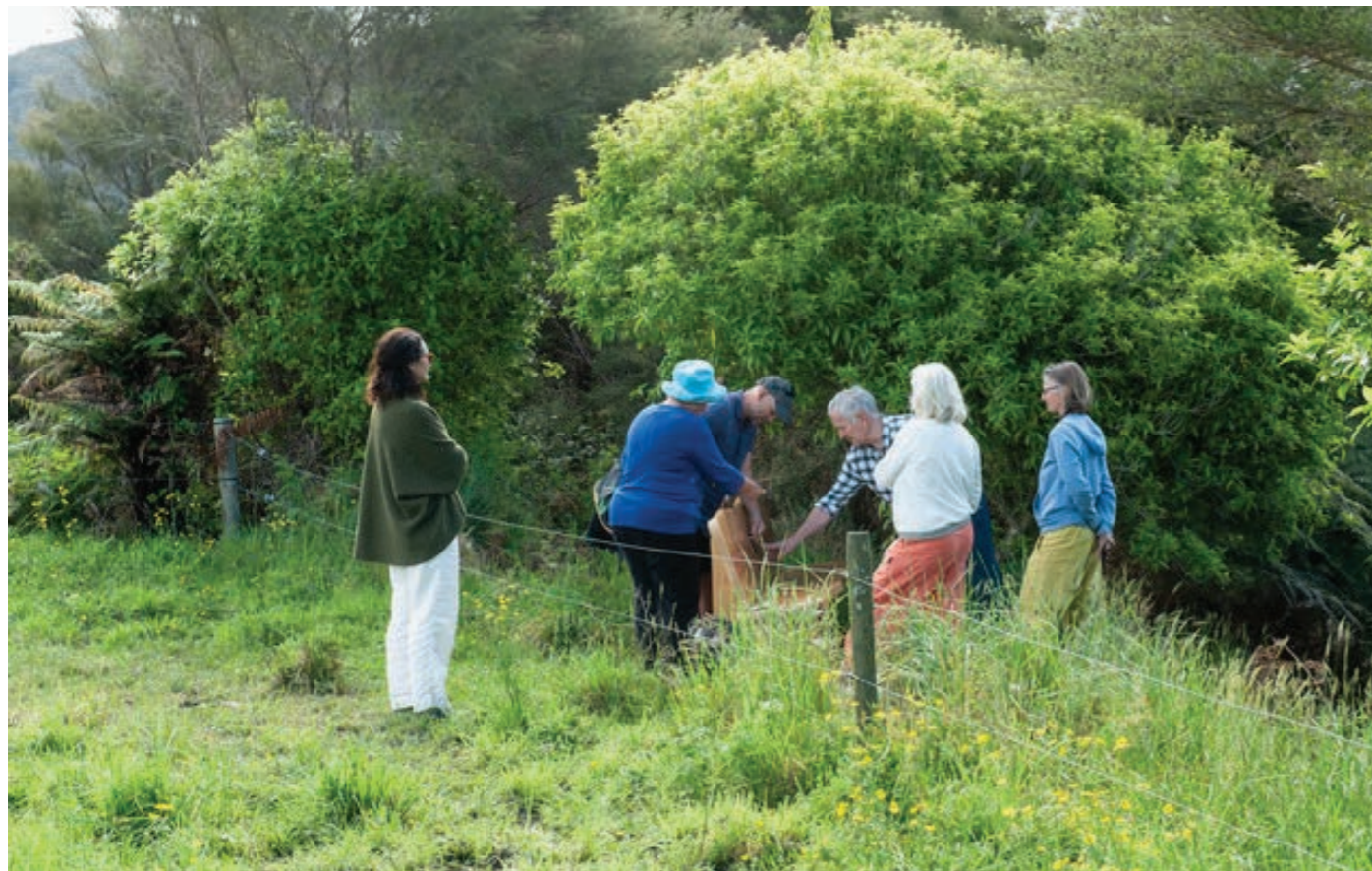
Memorial seat installation - November 2023