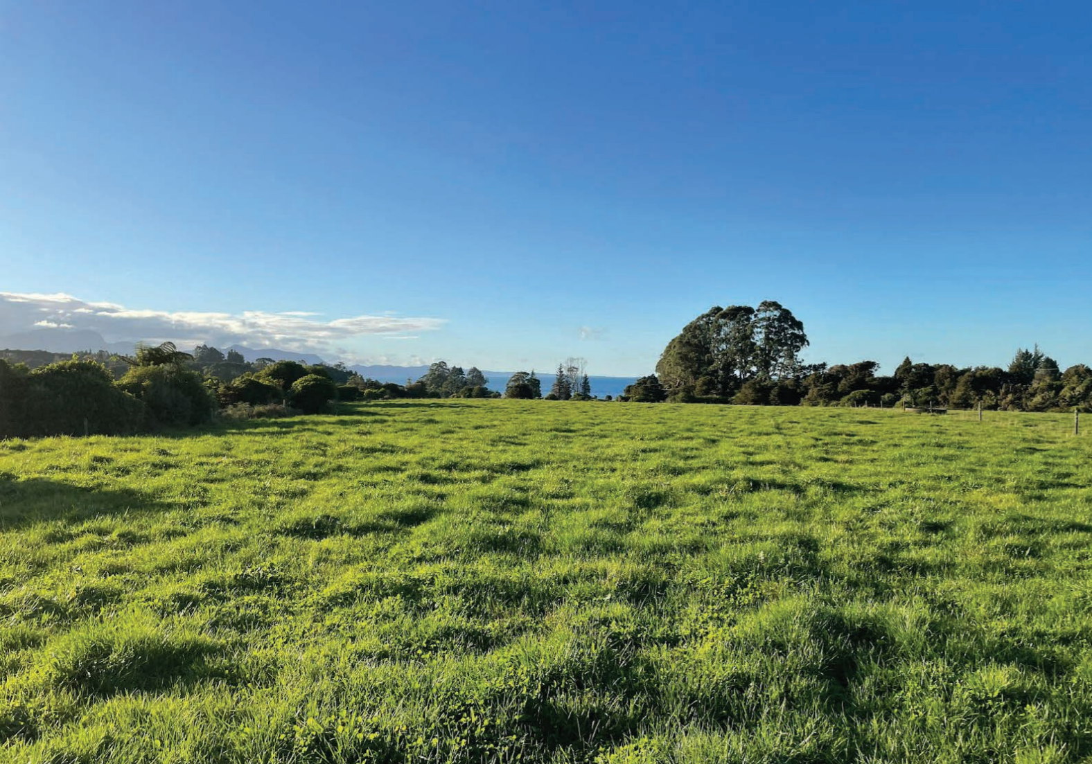
Views from the retreat centre site looking north - timeless and priceless :-)

interesting to see how people use the site. We have quietly observed where they actually gather there, where they like to practise, and what is attractive for them about the land. We have been developing our understanding of the totality of this place, with aspects of weather, season, natural environment, human, and local community all being essential to understand and work with, and inform how we move forward on this exciting project.